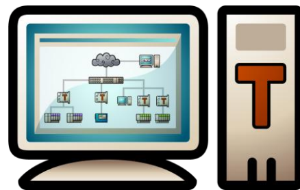
Tofino Central Management Platform (CMP)