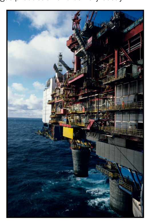
Figure 1: Natural Gas and Oil Processing Platform

An oil and gas production company operates a fixed natural gas and oil gathering and processing platform located in deep water on the US continental shelf. The platform serves multiple natural gas and oil wells connected by pipes running along the seabed back to the platform. The facility was designed to handle a high volume, thus there is a strong emphasis on reliability. Any downtime, whether caused by accidental or malicious forces, would interrupt oil and gas production and be very costly.