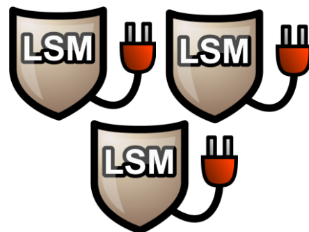
Tofino Loadable Security Modules (LSMs)

Customize the security functions in each zone